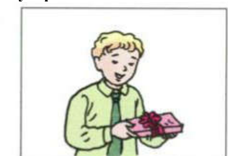
box of crayons / box of paints